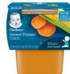
Sweet Potato Corn