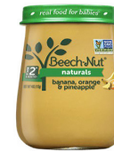
Banana Orange Pineapple