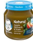
Apple Spinach Kale