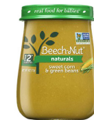
Sweet Corn Green Beans