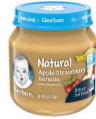
Apple Strawberry Banana