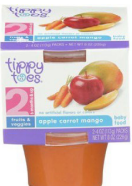
Apple Carrot Mango