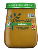
Mango Apple Avocado