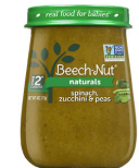
Spinach Zucchini Peas