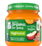
Sweet Potato Apple Carrot Cinnamon