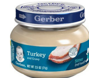
Turkey & Gravy