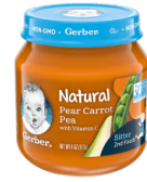
Pear Carrot Pea