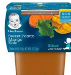
Sweet Potato Mango Kale