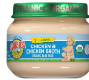
Chicken & Chicken Broth

For exclusively breastfeeding participants only Earth's Best Organic brand; 2.5-ounce glass jars only; Only the specific types as listed below: