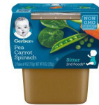
Pea Carrot Spinach