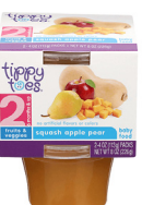
Squash Apple Pear