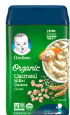
Oatmeal Millet Quinoa