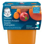
Sweet Potato Apple Pumpkin