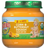
Corn Butternut Squash