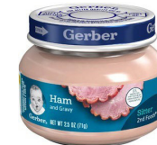
Ham & Gravy