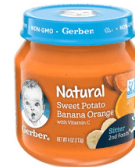
Sweet Potato Banana Orange