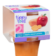
Apple Sweet Potato