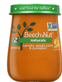
Carrots Sweet Corn Pumpkin