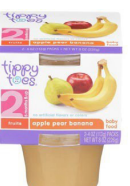
Apple Pear Banana