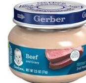
Beef & Gravy

For exclusively breastfeeding participants only; Gerber brand second foods only; 2.5-ounce glass jars only; Only the specific types as listed below: