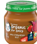
Apple Strawberry Beet