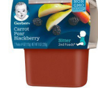
Carrot Pear Blackberry