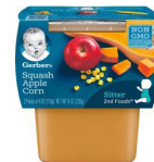
Squash Apple Corn