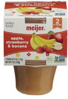
Apple Strawberry Banana

Meijer brand foods only; 2-4-ounce plastic twin-pack; Only the specific types as listed: