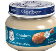
Chicken & Gravy