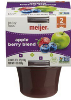
Apple Berry Blend