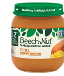
Corn Sweet Potato