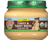
Turkey & Turkey Broth