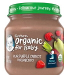
Pear Purple Carrot Raspberry