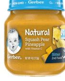
Squash Pear Pineapple