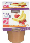
Apple Banana Strawberry