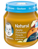
Apple Zucchini Peach