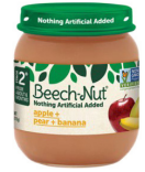
Apple Pear Banana